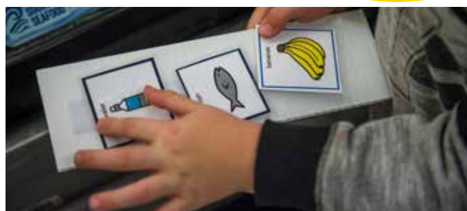
Diverse communication programs at ASELCC Burnie

We believe these programs will support the skill development of children and young people through opportunities to develop their social awareness and appropriateness, motor skills, communication skills, develop friendships, emotional regulation skills, improve behaviour and build skills needed for school, employment and community participation.