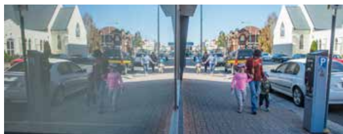
Out and about is an important element of programs at ASELCC Burnie