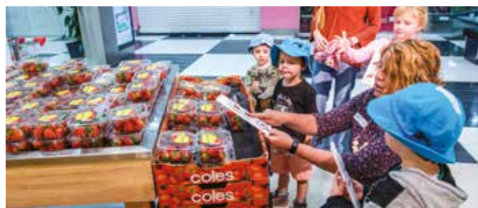
ASELCC Children get to practice their communication strategies at a Burnie supermarket